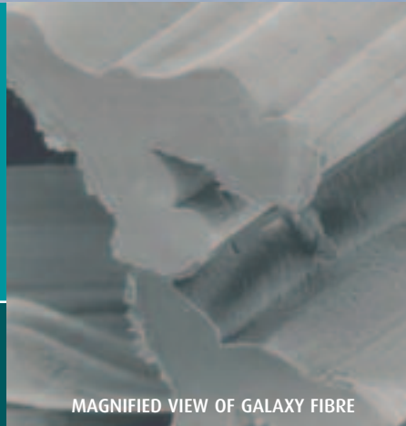
MAGNIFIED VIEW OF GALAXY FIBRE

Providing up to 30% more absorbency than both standard viscose and cotton, and with greater environmental and safety benefits, it's no wonder that Galaxy is the leading fibre for the international tampon industry. Time and again, manufacturers across the hygiene and medical sectors choose our high performance, trilobal viscose.